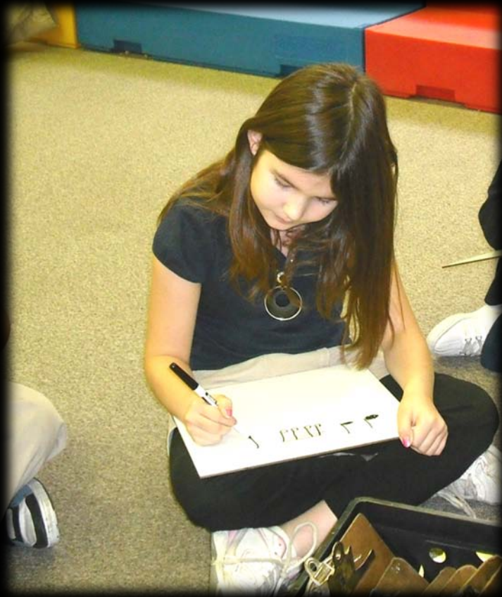
Rhythm Writers Work Station