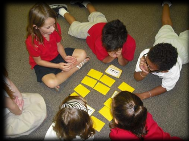
Playing Rhythm Concentration