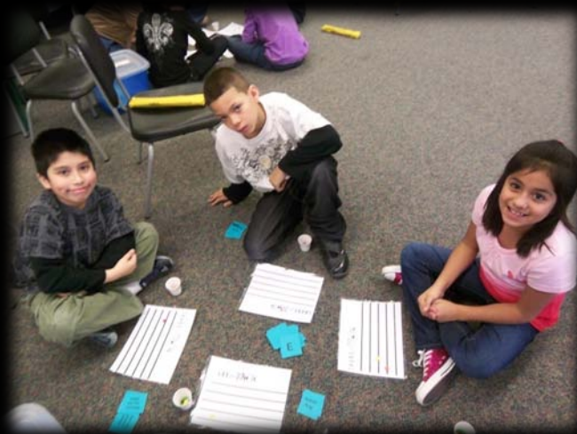
Skittle Staff Game