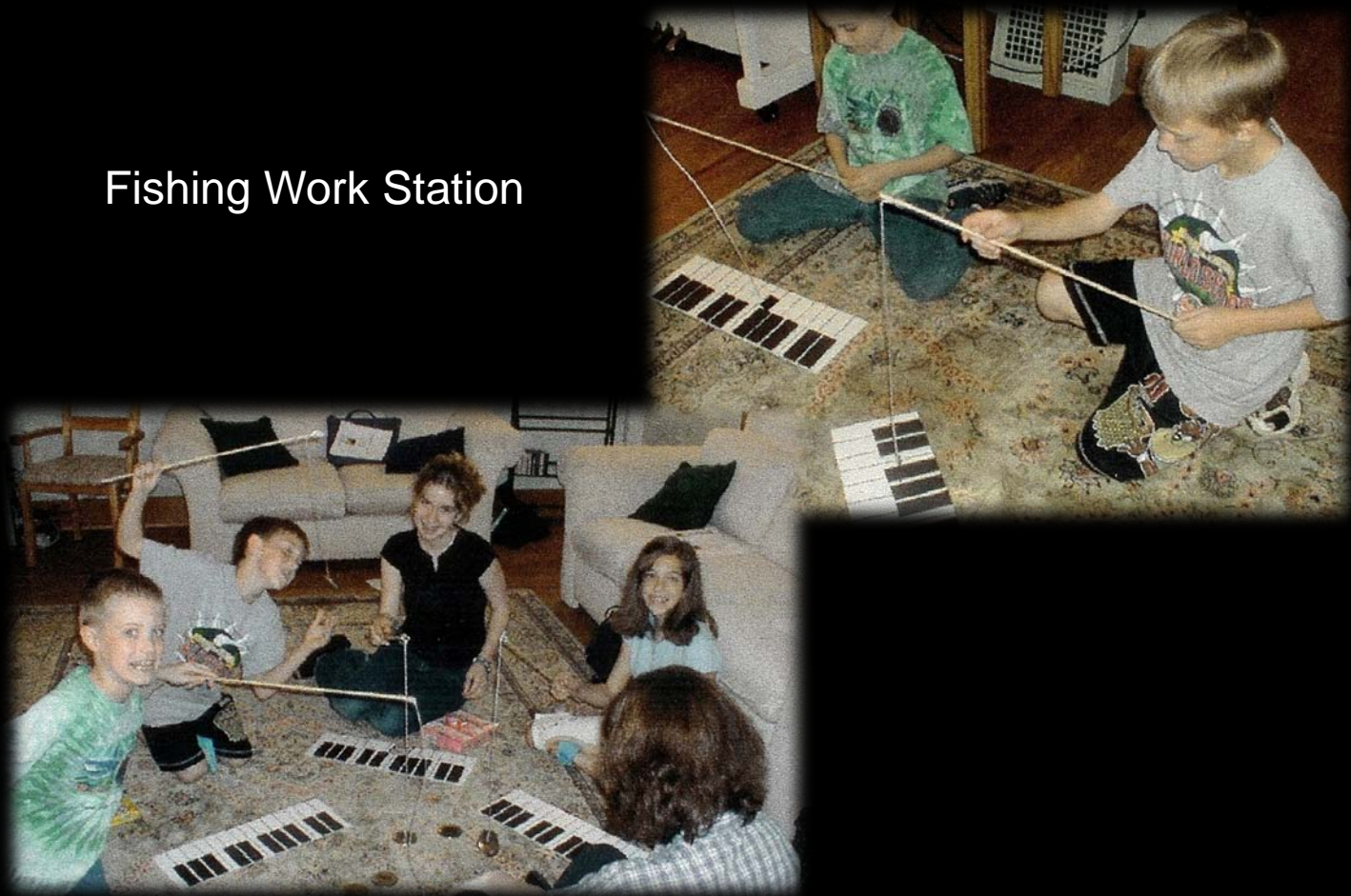
Fishing Work Station