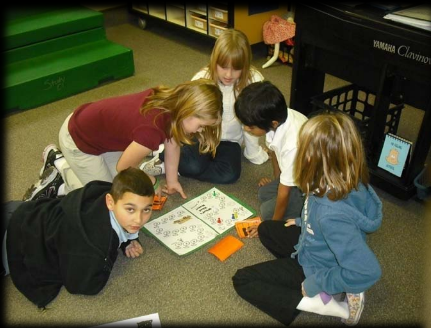
Game Work Stations