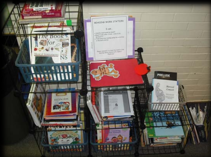
Reading Work Station